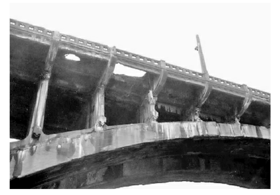
FIGURE 4 Corrosion-Induced Damage on Bridge Deck

Conventional reinforcing steel in concrete does not corrode unless the protection afforded by the high alkalinity of the concrete pore solution is compromised by chloride ions or carbonation. In North America, this primarily results from exposure to chloride ions from deicing salt and/or the marine environment. When the chloride ion concentration at the steel-concrete interface exceeds the threshold, corrosion is initiated. The time—from construction— required to initiate corrosion is termed time to initiation . Once corrosion is initiated, corrosion products are formed. The products of the corrosion process (iron oxides, such as rust) occupy a greater volume than the original steel.<sup>44</sup> The expansive productsubstructure elements of the corrosion process generate tensile stresses in the concrete. Because the tensile capacity of concrete is relatively limited, these stresses result in cracking, delamination, and eventually spalling. The time from corrosion initiation to formation of delamination has occurred and with time can incur sufficient cross-section loss to adversely affect the overall integrity of the element.