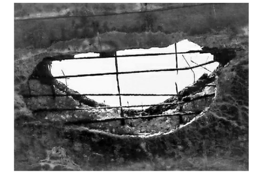
FIGURE 1 Loss of Cross-Section of Reinforcement as a Result of Corrosion

Corrosion of reinforcement significantly increases the cost of bridge preservation. With the limited availability of maintenance and preservation funds, controlling corrosion has become a top priority for many bridge owners. In addition, corrosion of the reinforcement can result in catastrophic failures, with accompanying loss of human life and significant impact on the local economy.