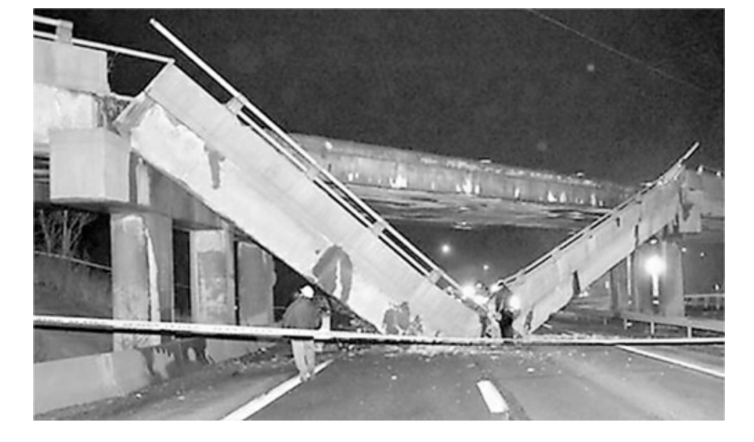
FIGURE 3 Collapse of I-70 Overpass as a Result of Prestressing Cable Corrosion

Generally, corrosion of conventional reinforcement provides sufficient early warning to allow remediation measures to be implemented. For example, the superstructure of the historic Jefferson Street Bridge in Fairmont, West Virginia, shown in Figure 4, had developed significant corrosion-induced damage. Although the reduction in operating capacity and the resulting danger posed to the driving public is clearly observable, it was not expected to catastrophically fail. However, rehabilitation cost approximately $25 million.